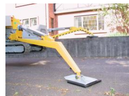
Easy set up