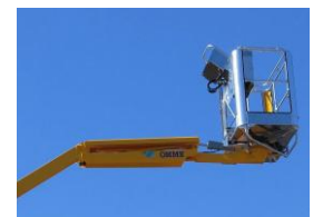
Fly jib (option)